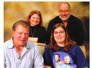
Our good buddy, Bill Shatner