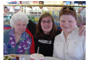
Farmer's Market with Grandma