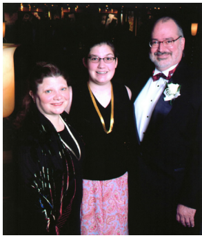
Coral Princess Formal Night