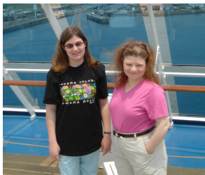
Panama Canal Transit