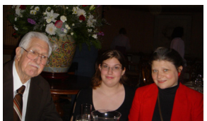
Christmas Eve with Pop Pop