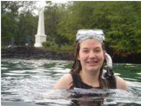
Snorkeling on the Big Island