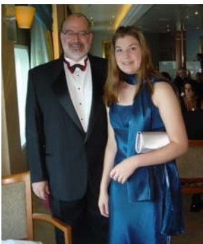
Cruising off Spain