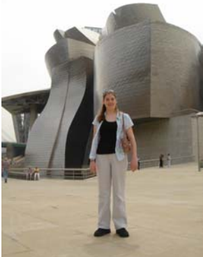
The Guggenheim in Bilbao