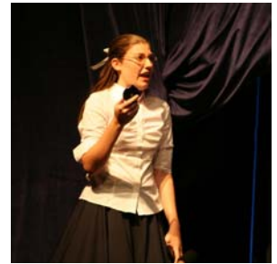
A Midsummer Night's Dream