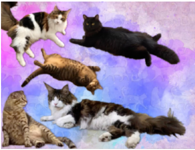
So many cats!

Well 2021 was certainly an improvement over 2020. The vaccines made all the difference. By May we were able to get out and visit some of our favorite restaurants and gradually ease back out into the world. Who knew going to the grocery store to select our own produce would be such a luxury? Let's hope new variants don't set us back.